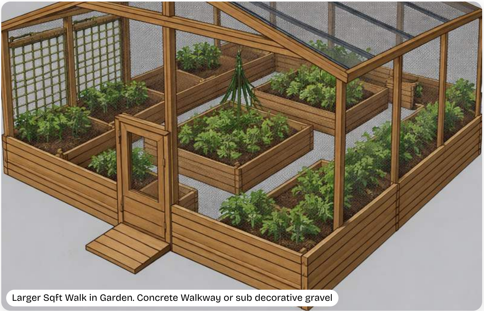
Larger Sqft Walk in Garden. Concrete Walkway or sub decorative gravel