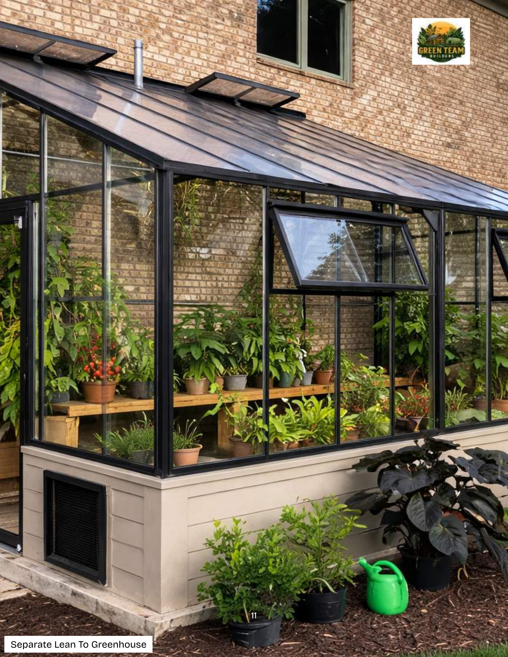
Separate Lean To Greenhouse