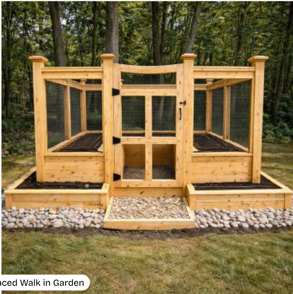
No Roof Open Faced Walk in Garden