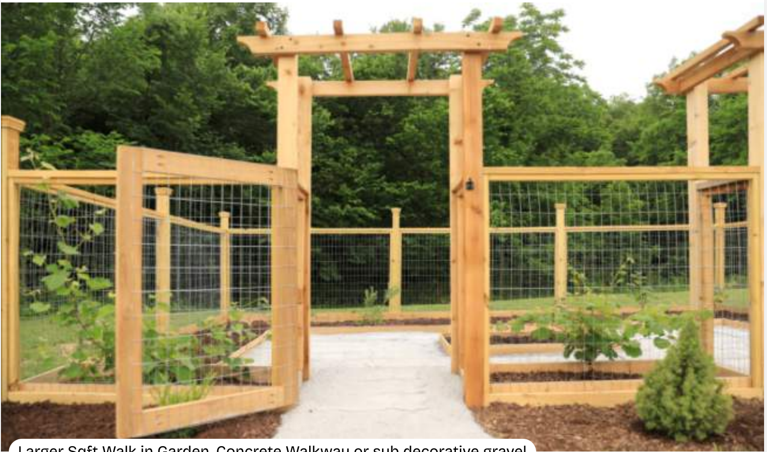
Larger Sqft Walk in Garden. Concrete Walkway or sub decorative gravel