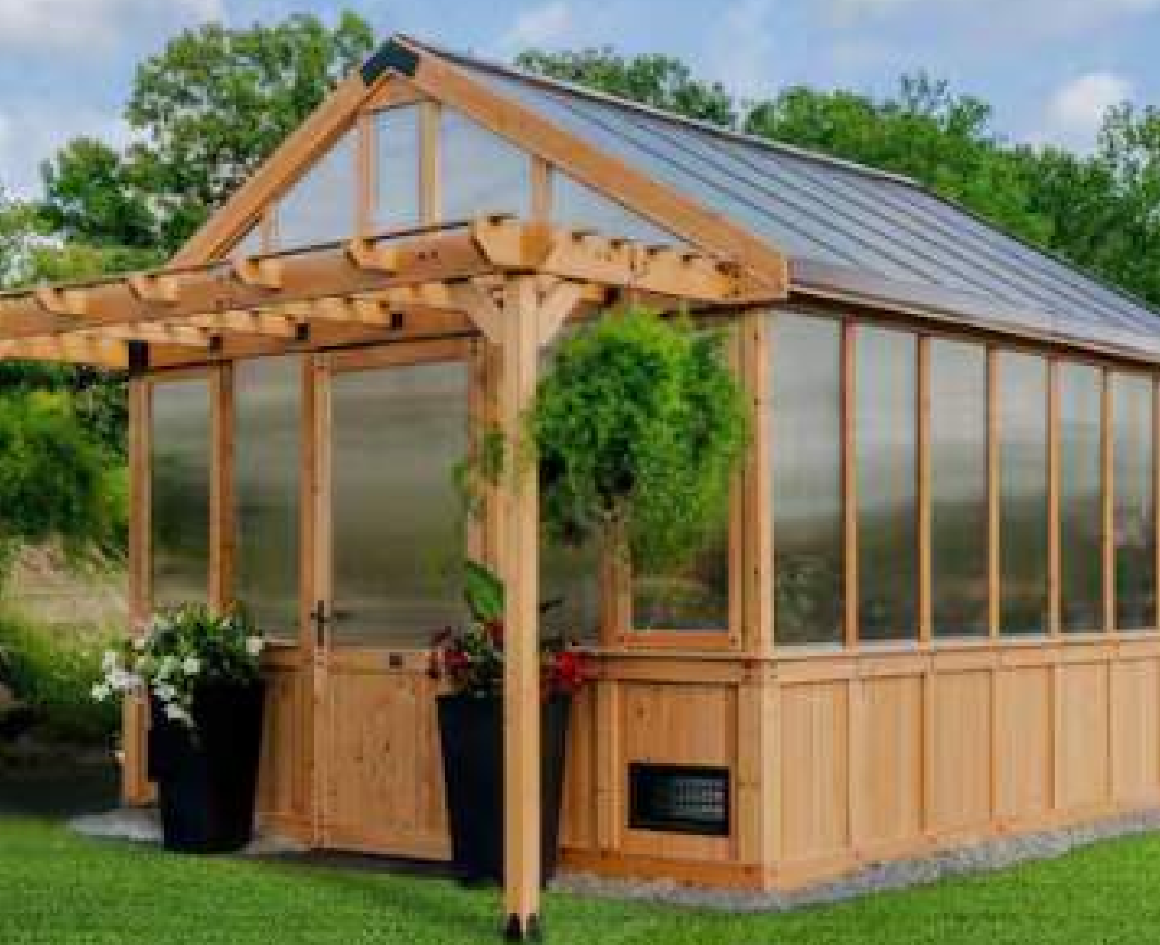
Enclosed Roof with Poly Panels