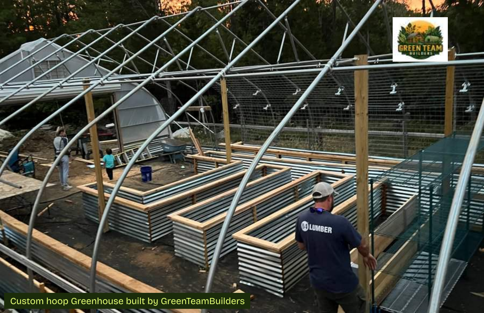
Custom hoop Greenhouse built by GreenTeamBuilders